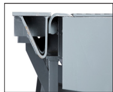
Constant Radius Rear Hinge