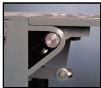
Two-point Crown Control