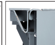
Constant radius rear hinge