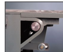
Two-point crown control