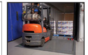
Full-width End-load Access