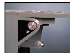
Two-point crown control