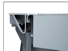
Constant radius rear hinge